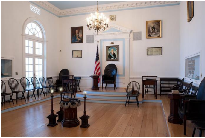
Above: The Replica Lodge Room.