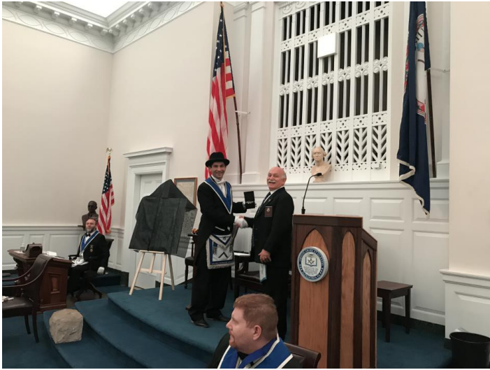
Below: Receiving a gift from sunny Florida.