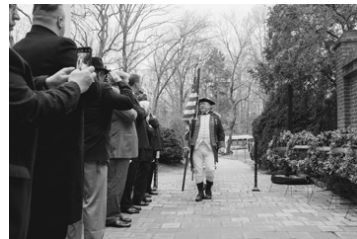
Present the Colors!