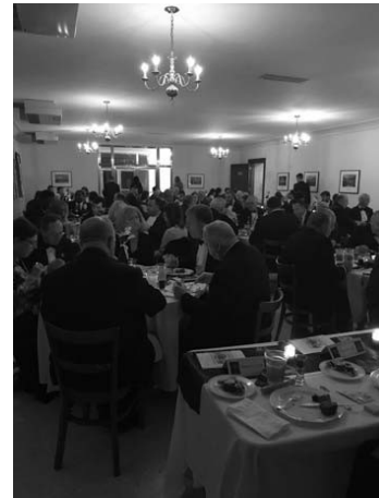
GW Birthday Celebration Banquet