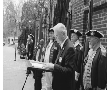
Our GM addresses everyone at the tomb