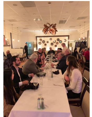
Below: A wonderful evening at last year's last Ladies and Friends Night. We are anxiously awaiting the upcoming Ladies and Friends events in 2019.