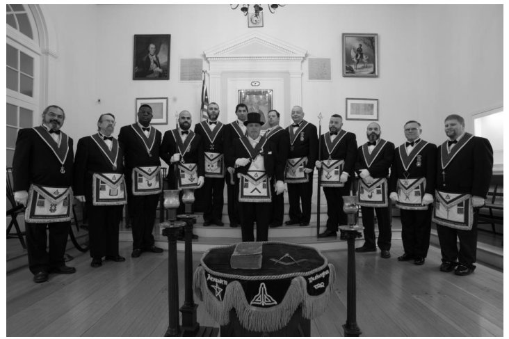
2018 Officers of Alexandria-Washington Lodge No. 22