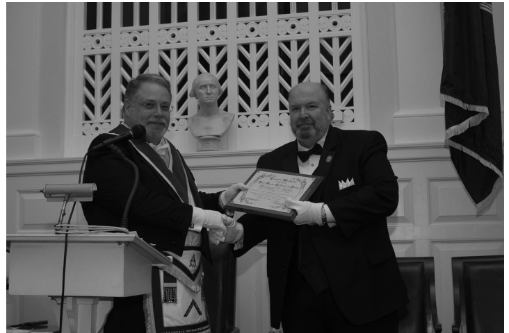
Presenting the out-going Worshipful Master with a Certificate of Service Award