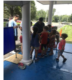
Lining up for water balloons

On Saturday, June 30, District 1A, 54 and Elmer Timberman Lodge from 1B came together for a joint picnic. In 2019 all 3 entities will become one district – Masonic District 1A.