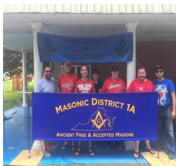
Picnic Committee with 1A&54 banners