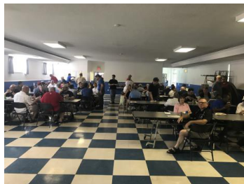
Some chose inside for eating at the picnic