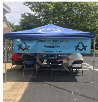
Cigar Herf Tent with banner